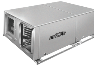
C-Series Horizontal 1 - 15 Tons Special Configuration Engineered to Order