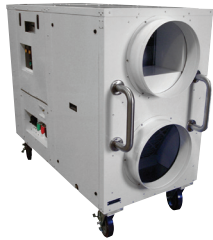
Portable Cooling and Heating Units 3-30 Tons