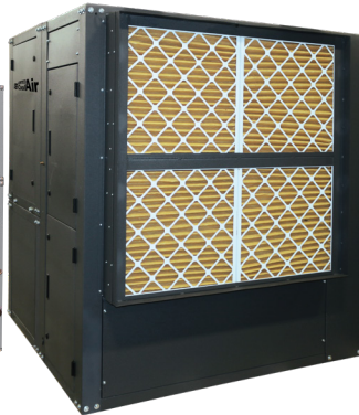
VariCool® VAV, 9 - 70 Tons