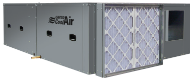
C13-Series Horizontal 2 - 10 Tons