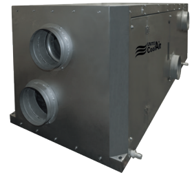
Alpha Aire 100 - 500 CFM