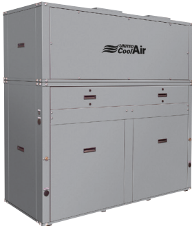
VertiCool Aurora Vertical, 3 - 35 Tons