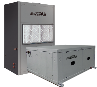
OmegaAir Horizontal and Vertical 100% Outside Air 150 - 3000 CFM