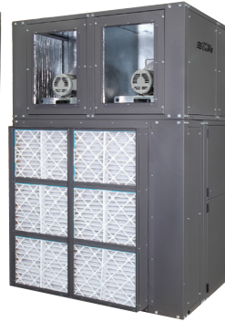
VariCool® EZ-Fit VAV, 12 - 90 Tons