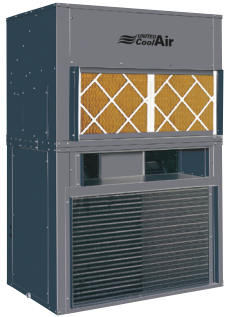
VertiCool Classic Vertical, 3 - 30 Ton